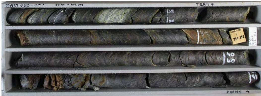
Diamond Core Hole 3