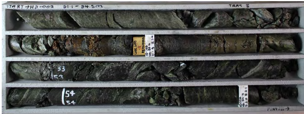
Diamond Core Hole 2