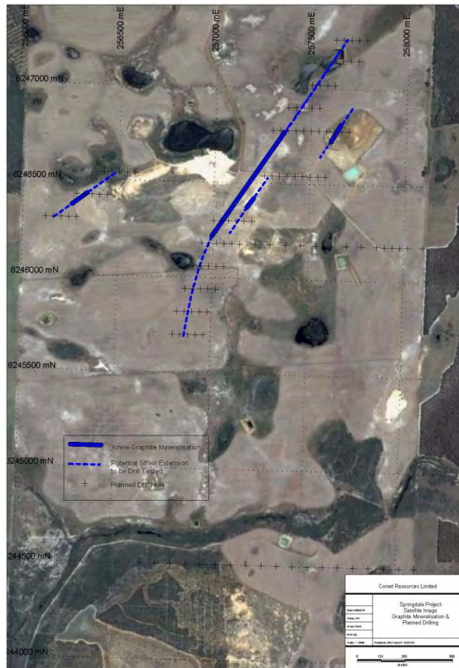
Google Earth Image showing the exploration program.

The aircore drilling program has also been completed. Graphite has been logged in 40 holes (to be confirmed by assaying). All graphite samples are in the laboratory for assaying. This program tested strike extensions to the discovered graphite zone and other graphite zones.