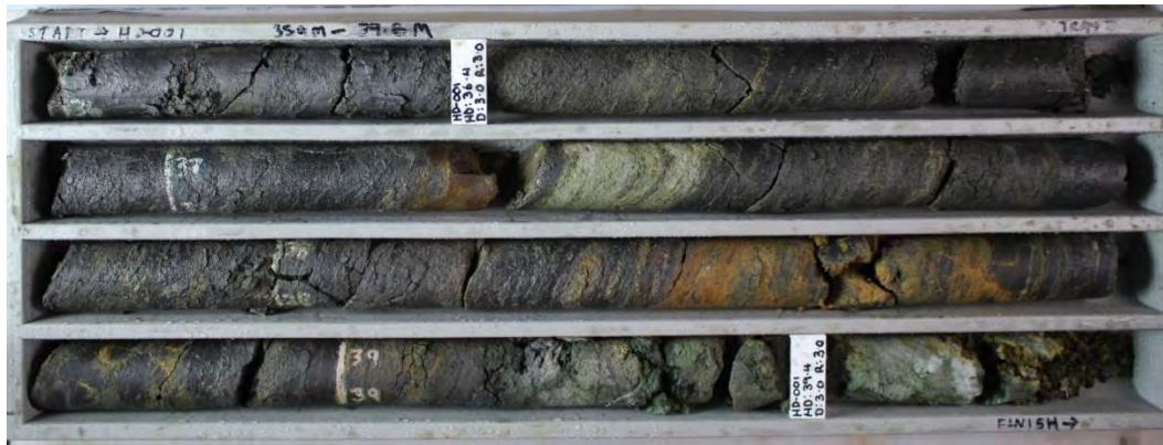
Diamond Core Hole 1