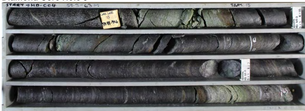
Diamond Core Hole 4