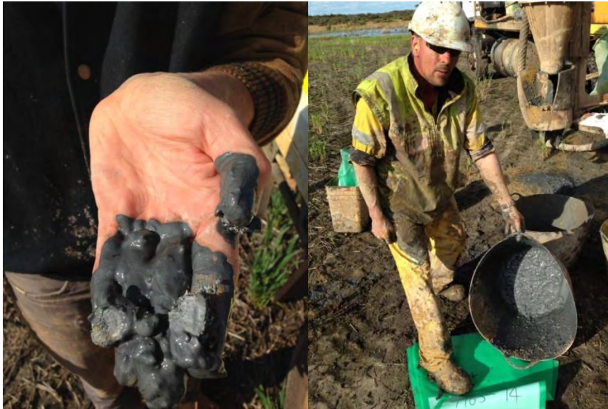
Aircore drilling from the current program

The aircore drilling program has also been completed. Graphite has been logged in 40 holes (to be confirmed by assaying). All graphite samples are in the laboratory for assaying. This program tested strike extensions to the discovered graphite zone and other graphite zones.